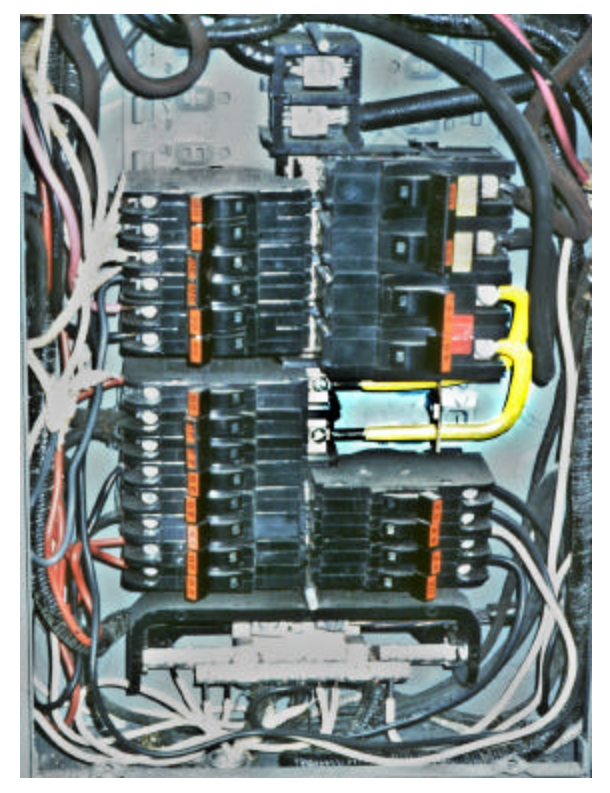
Figure 3 – Split Bus Panel

Prior to 1984, many manufacturers offered "split bus" panels for residential use, such as the panel in figure 3. These panels have no main breaker. They do meet the rule requiring no more than 6 disconnects, and one of these disconnects feeds a separate bus that typically contains the 15 and 20 amp 120 volt circuits. The advantages of a split bus panel were purely economic. If the largest breaker was the one feeding the secondary bus, and it was rated at 50 amps. it cost less than a single main 100 amp breaker. In addition to the "six disconnects" rule for service equipment, another rule also applies to panels that are categorized as "lighting and appliance" panels. These are panels where more than 10% of the breakers are rated 30 amps or less and serve circuits with neutrals. These lighting and appliance panels must be capable of having their power disconnected by not more than 2 hand movements. Until 1984, the code exempted these panels from the "twodisconnects" rule when they served as residential service equipment. Today, the code allows them to remain when they are "existing" service equipment, though it would not allow a new installation of such a panel.