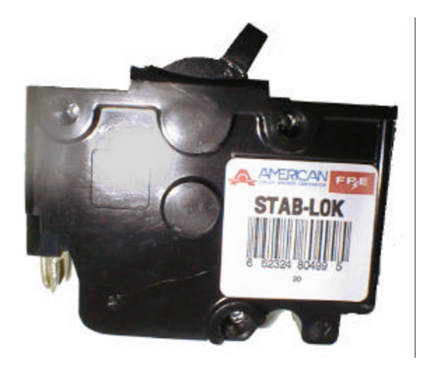
Figure 10 – Replacement Stablok breaker

Another consideration is the desire to install GFCI or AFCI breakers. GFCI breakers can sometimes be found in the specialty supply houses, and they are very expensive. Since GFCI protection can also be provided by receptacle outlets and other feed-through devices, the lack of available GFCI breakers is not a major issue. As of this writing, no listed AFCI breakers are available for FPE panels.