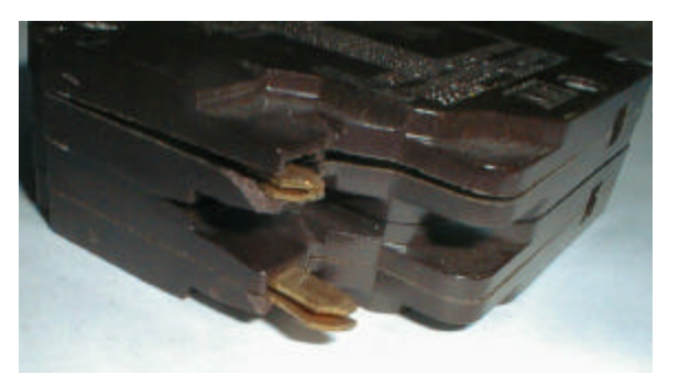
Figure 8 – Damaged "E" type breaker

Not only do "E" breakers make poor connection to "F" sockets, forcing them into the socket can damage them. The breaker may split when shoved into the slot, with the bus stab receding inside the breaker (figure 7). Since it is now making a very loose contact to the bus, the breaker might fall right out when the deadfront cover is removed (figure 9). Inspectors can be forewarned of this condition before taking off the cover. Simply look at the label for the panel to see where the "E" slots are located and whether any "E" breakers have been inserted into "F" slots. When finding that situation, there is no need to remove the cover to know that the breaker is in the wrong position.