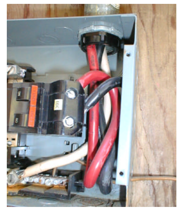
Figure 1 – Insufficient wire bending space

Several of the problems found with FPE panels are found in other brands of equipment of the same age. There is less gutter space in the panel than we find in modern equipment. The result is crowding of the wires in the panels. It is sometimes impossible to see all of the terminals in an FPE panel. The space for bending wires is also less than required in modern panels. The rules that proscribe minimum wire bending space are found in the National Electrical Code (NEC) in section 312.6 in the 2002 edition. Over the years, the required minimum space has increased, with the most significant changes in the 1981 NEC, near the verv end of the days when FPE panels were made. FPE manufactured some panels with less clearance than the minimum code rules by installing the lugs at an angle, so the conductor was already parallel to the wall opposite the breaker terminal (figure 1). However, the bends shown in figure 1 defeat the purpose of the angled lugs, and the wire is bent too sharply.