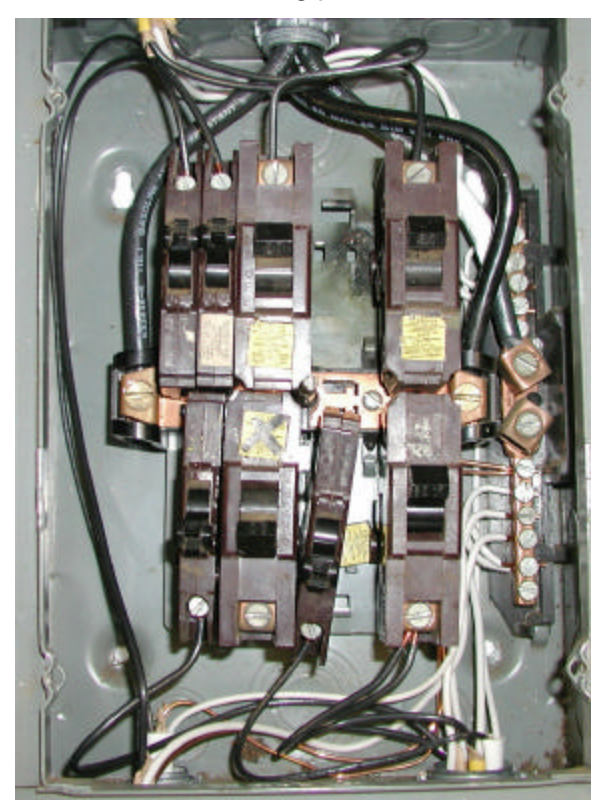
Figure 9 – Loose breaker

Not only do "E" breakers make poor connection to "F" sockets, forcing them into the socket can damage them. The breaker may split when shoved into the slot, with the bus stab receding inside the breaker (figure 7). Since it is now making a very loose contact to the bus, the breaker might fall right out when the deadfront cover is removed (figure 9). Inspectors can be forewarned of this condition before taking off the cover. Simply look at the label for the panel to see where the "E" slots are located and whether any "E" breakers have been inserted into "F" slots. When finding that situation, there is no need to remove the cover to know that the breaker is in the wrong position.