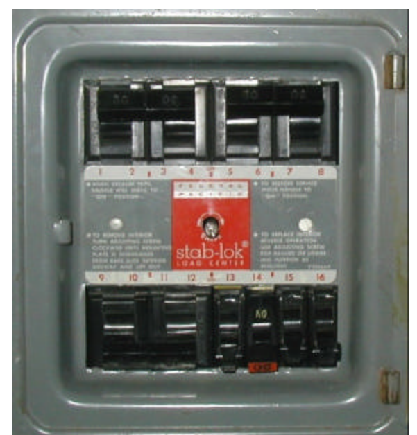
Figure 2 – Breakers that are on when down

Since the 1984 edition of the NEC, breakers that operate with their handles in a vertical position must be on when in the up position, and off in the down position. Prior to that time, several manufacturers made equipment such as that seen in figure 2, with a row of breakers that was on when down and off when up. The word "on" when upside down is "no." Inspectors encountering such equipment might want to warn their clients that these FPE breakers are on when facing the outer edge of the panel, and off when facing the center of the panel. It can be very difficult to remove these covers without accidentally tripping a breaker.