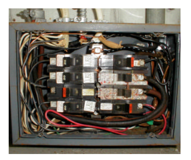
Figure 4 – Overcrowded FPE panel with wires obscuring terminals, neutral bar, and bonding jumper. If the wires press against the deadfront, it may pop out and trip the breaker handles as soon as the panel screws are removed.

There are at least 5 design issues that are no longer allowed by code: the gutter space. the wire bending space, spring-mounted bus, breakers that are on when down, and the split bus service equipment. These issues mean that a panel that has been sitting on the hardware store shelf for 20 years would not meet today's code, despite the UL listing of the panel at the time it was manufactured. Another even greater concern is that older breakers - of any brand do not become more reliable with age. The internal mechanical components can become corroded or distorted, and the springs, hinges, and levers inside the breaker might not operate as designed after sufficient passage of time. Most breaker manufacturers guarantee their products for only a year, and for valuation purposes breakers are considered fully depreciated after 15 years.